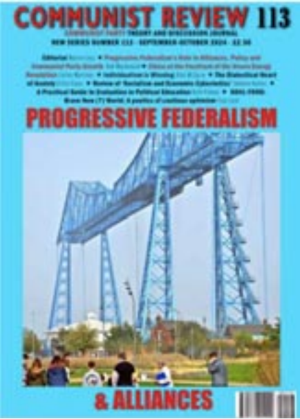
Autumn 2024 £4.50 Price includes shipping. EU purchasers and subscribers may be liable to local VAT payments on delivery.