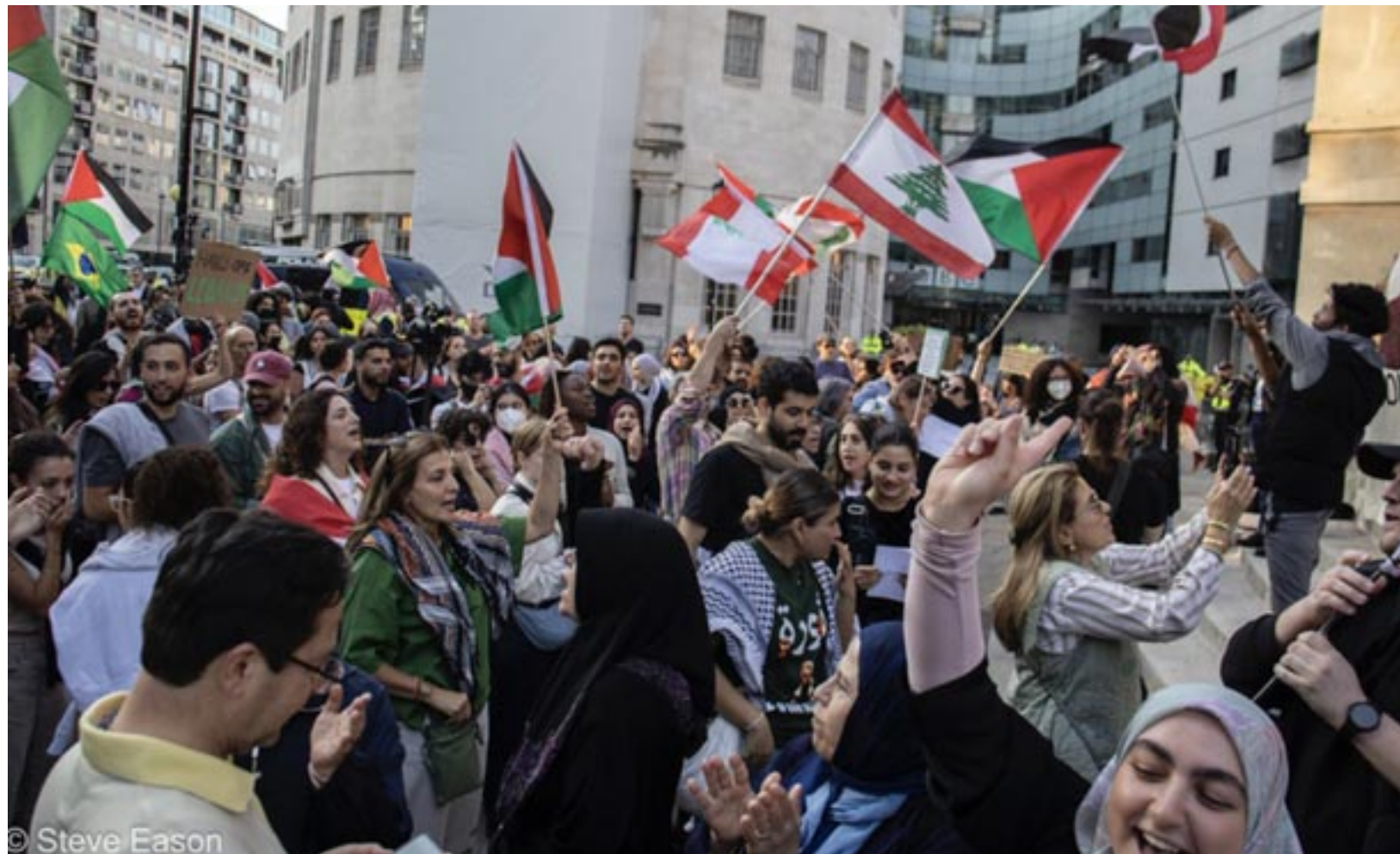
▲ Stop the War demonstration in London

The waters of the sea are tormented in the night, and the wood is torn, the sea slips, and a serpent under the hearths and the stone. The sea rises around our houses and streams our clothes; It remains, after it has plunged into its abyss, only a creaking sea, filling the horizon. Our beds and our souls then dry up like the shores. And the city remains deprived of its lap? from the poem Sur in tribute to the port of Tyre by Lebanese communist poet Abbas Baydun written on his release from prison.