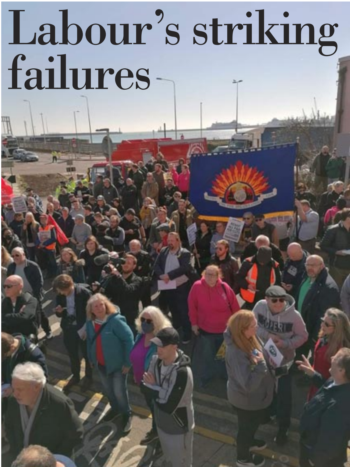
▲ Sacked P&O Ferry workers rally at Dover

‘The last General Election has had at least one beneficial result: it has shocked many more people into a recognition of the fact that the Labour Party is a sick party. And it has also helped many more people within it to realise that the sickness is not a surface ailment, a temporary indisposition, but a deep organic disorder, of which repeated electoral defeats are not the cause but the symptom. What this means is that the sickness would have been as serious if Labour had won.’ Ralph Milliband writing in 1960.