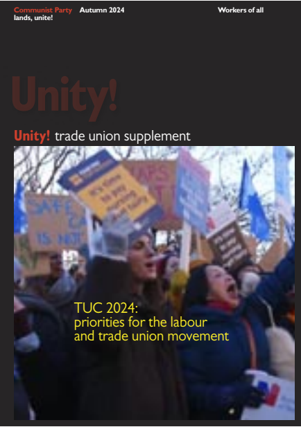
Unity! Trade Union Supplements available to download at www.communistparty.org.uk