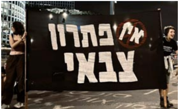
▲ 'There is not military solution', Hadash members calling for peace and ceasefire and against the war in Gaza and Lebanon outside the Israeli army headquarters in Tel Aviv. October 5, 2024

Full account of Ruth Styles' speech Page 2